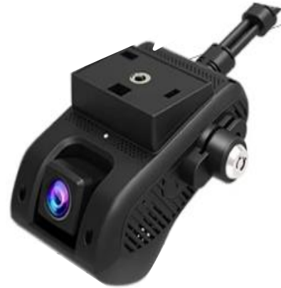
TF Card & SIM Card Lock